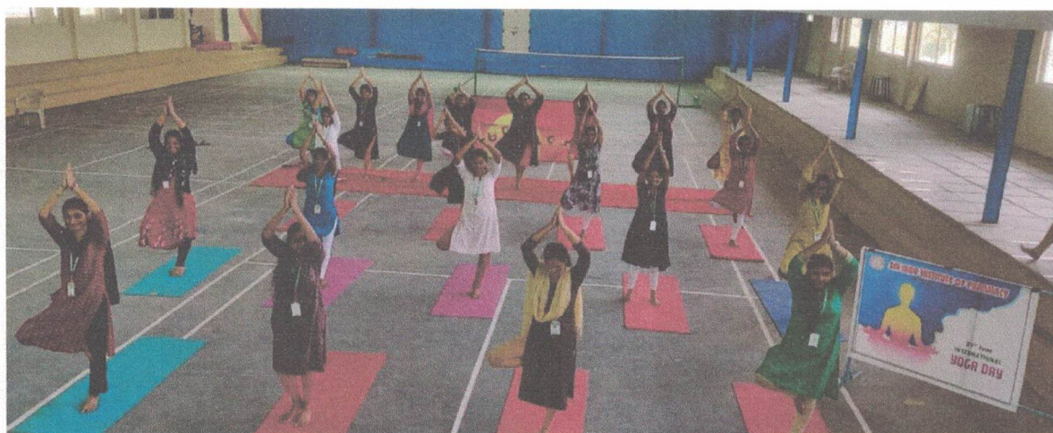
Participation of staff and students - Yoga Day