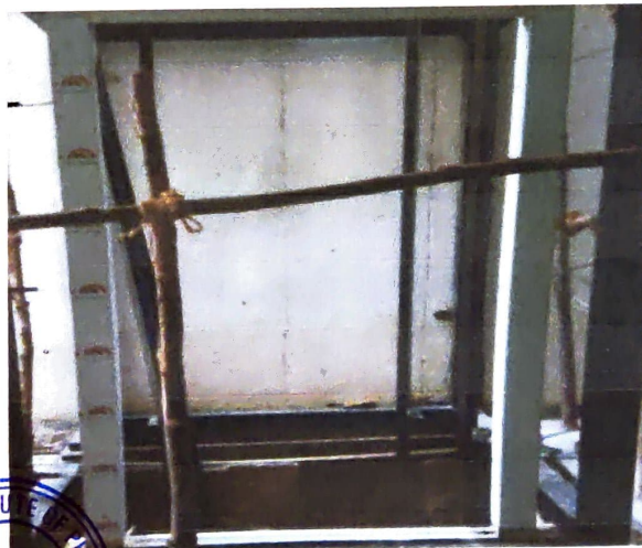
Provision for lift (under erection):

A.M.M! PRINCIPAL SRI INDU INSTITUTE OF PHARMACY Sheriguda (V), Ibrahimpatnam (M), R.R. Dist. Hyderabad-501 510.