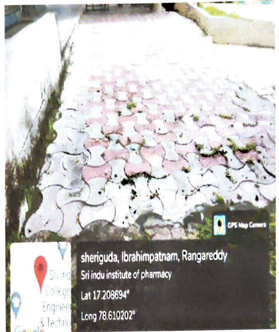
Ramp for easy access to main block: