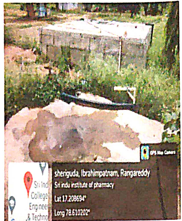
Recycling waste water through RO Plant and treated water storage tank